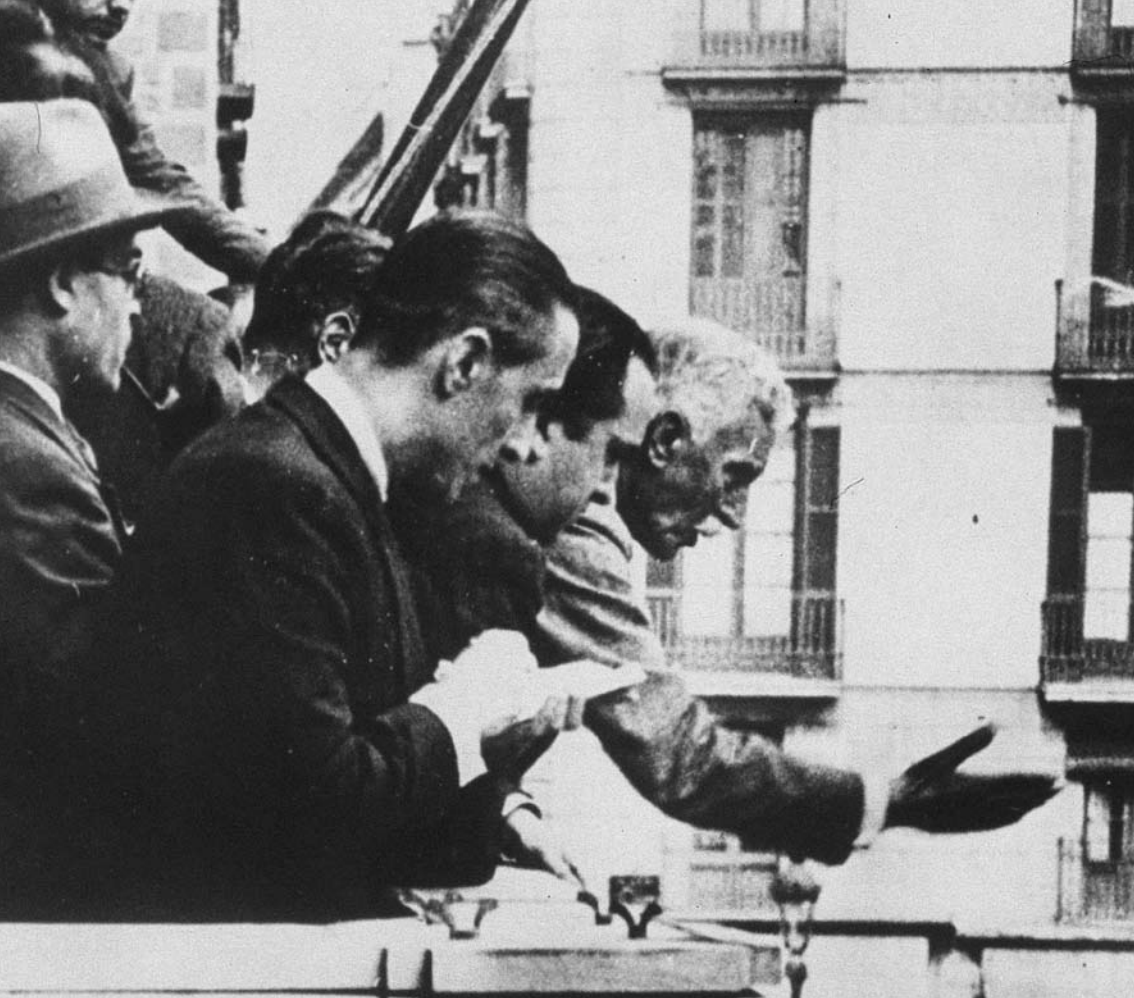
14 APRIL 1931 FRANCESC MACIÀ PROCLAIMS THE CATALAN REPUBLIC