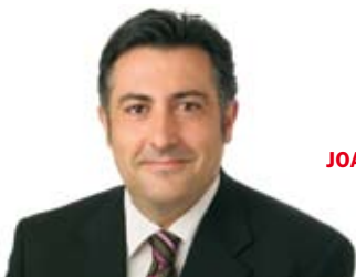
JOAN PUIGCERCÓS PRESIDENT OF ESQUERRA

Currently, Esquerra is again a decisive organization and is one of the members of the Catalan Government.